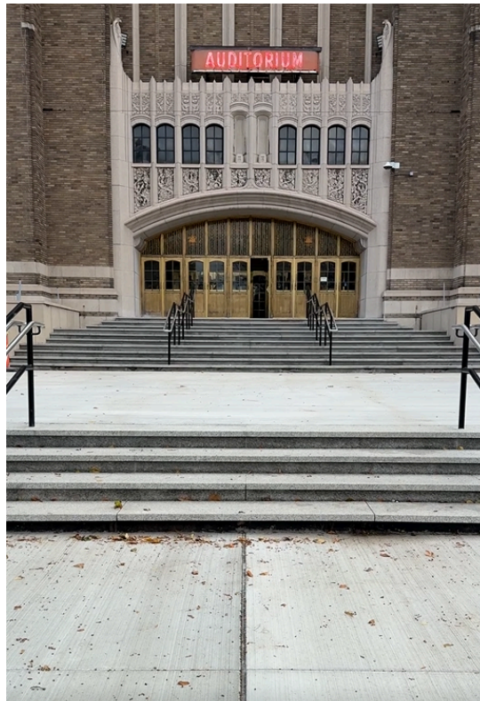
The freshly poured concrete steps outside the West Herr Auditorium Theatre.

"As people see the new spaces for the first time, the most common word we're hearing is it's 'shocking,' and I think that's going to be the emotional