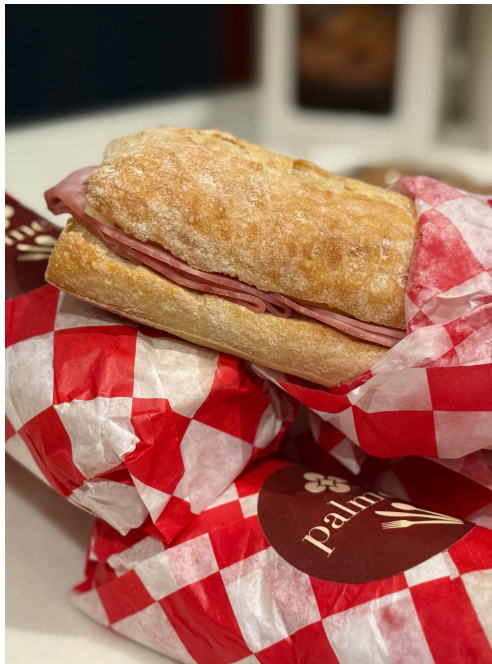
The new baguette sandwich (ham or turkey & cheese) now offered in the Floreano Room.