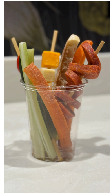
A charcuterie cup is now available on the menu.

For a more in-depth look at the new menu and to hear more about what went into creating it, check out our video on the West Herr Performing Arts Center Facebook , Instagram or LinkedIn pages.