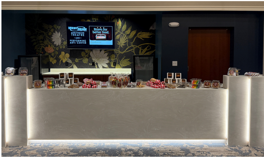
The new bar in the restored Floreano Room, open 90 minutes prior to curtain.

“We want to exceed the expectations, we don’t just want to meet them,” added Palmer Foods CEO Kip Palmer. “There are going to be some options that everyone really enjoys, but we’re also going to change it up. We believe audiences will have fun and it’s going to be a night at the theatre.”