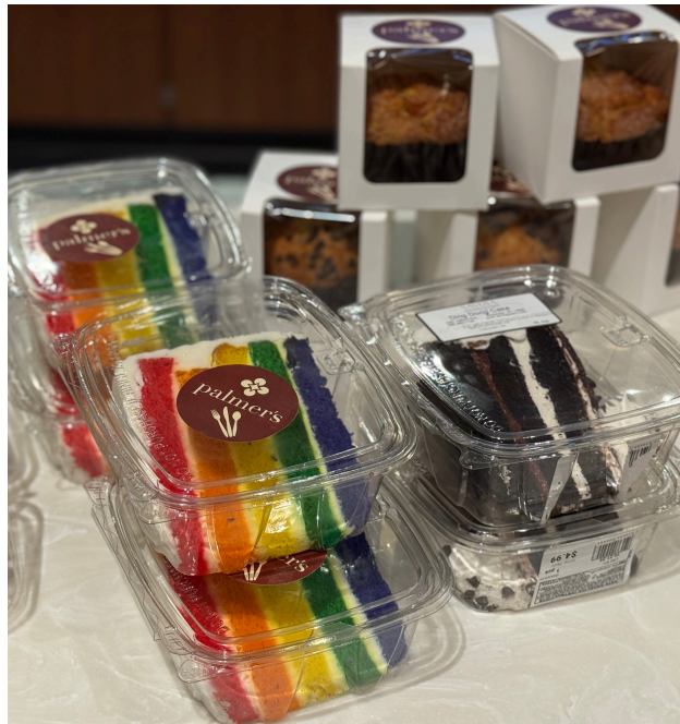
Muffins are available during matinees, while assorted pies & cake slices are offered at all performances.