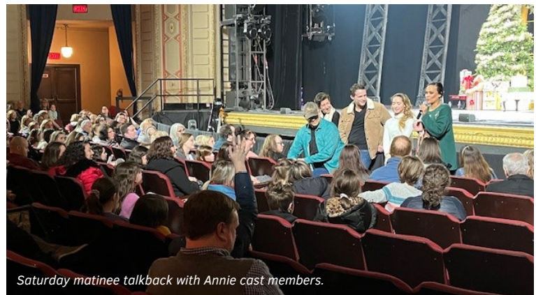
Saturday matinee talkback with Annie cast members.

Also, in education this December, 54 people enjoyed a weekend in New York City as part of RBTL's annual Holiday Trip. The group left Rochester via bus on December 8 to head to the Big Apple. On the agenda for the weekend: a performance of "Radio City's Christmas Spectacular" and "Some Like It Hot." The rest of the weekend was spent sightseeing, shopping or watching another show on their own time before returning home on Sunday. RBTL hosts two weekend trips to New York City per year. The next will take place this Spring and includes deluxe motor coach transportation, two-night hotel accommodation and great seats for two shows. Find out more information at RBTL.org/nyc-weekend .