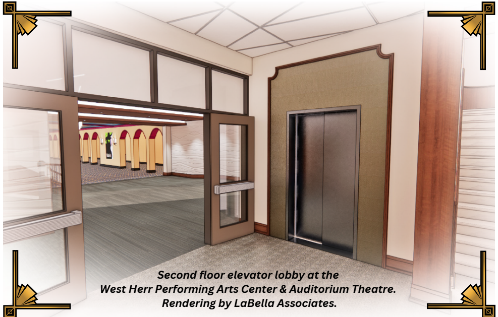
Second floor elevator lobby at the West Herr Performing Arts Center & Auditorium Theatre.