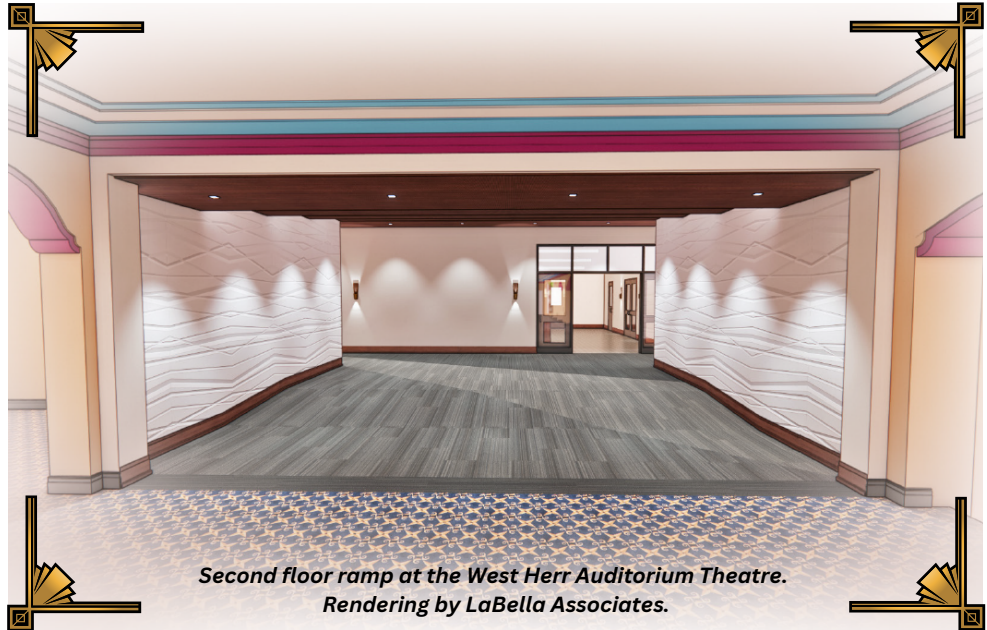
Second floor ramp at the West Herr Auditorium Theatre. Rendering by LaBella Associates.