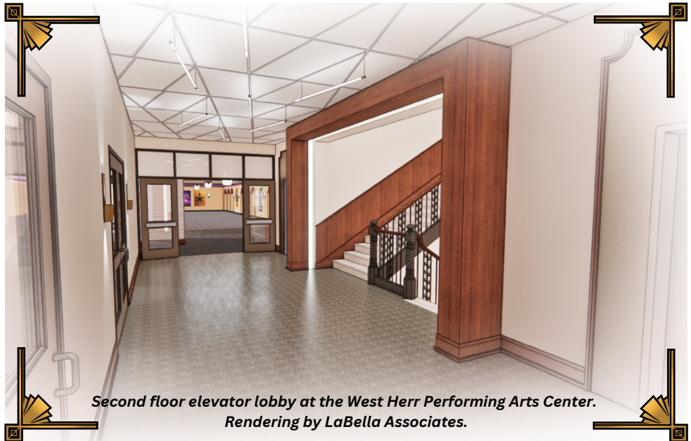
Second floor elevator lobby at the West Herr Performing Arts Center.