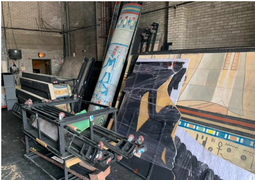
Preparing the set and props for Finger Lakes Opera's presentation of "Aida."