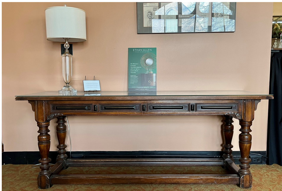
Below: Original furniture piece.

THANK YOU FOR SUPPORTING UKRAINE RELIEF!