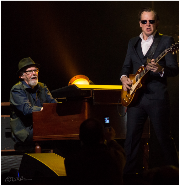
Reese Wynans & Joe Bonamassa